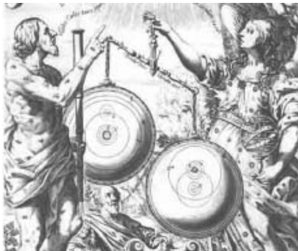
Fig. 2: Tycho's system outweighs Copernicus' heliocentric arrangement in this detail from the frontispiece from Giambattista Riccioli's Almagestum novum (Bologna, 1651) (author's collection).

this book', Osiander wrote (and I paraphrase). 'But not to worry. It is the astronomer's task to make careful observations, and then form hypotheses so that the positions of the planets can be calculated for any time. But these hypotheses need not be true not even probable. A philosopher will seek after truth, but an astronomer will just take what is simplest. And neither will find truth unless it has been divinely revealed to him.' 5